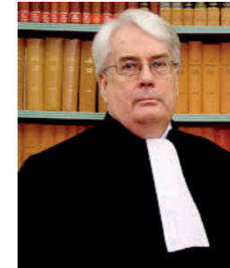
The Hon. Mr. Justice Frank Clarke

Justice Kiefel was appointed to the High Court of Australia in September 2007. At the time of her appointment she was a judge of the Federal Court of Australia. Justice Kiefel is also one of the Patrons of the IATC.