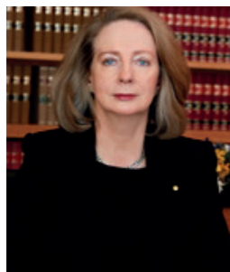
The Hon. Justice Susan Kiefel, A.C.

Lord Walker is a retired Justice of the Supreme Court of the United Kingdom. Lord Walker was made Lord of Appeal in Ordinary in October 2002, and on 1 October 2009 he was invested as a Justice of the Supreme Court alongside nine other Lords of Appeal in Ordinary. After his retirement in 2013, Lord Walker continues to serve as a Non-Permanent Judge of the Hong Kong Court of Final Appeal. He is one of the Patrons of the IATC.