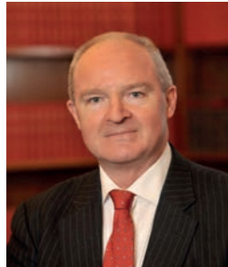
The Rt. Hon. Sir Declan Morgan Lord Chief Justice Of Northern Ireland

Sir Declan Morgan was educated at Peterhouse, Cambridge. He was called to the Bar in 1976 and took Silk in 1993. He was Senior Crown Counsel for Northern Ireland from 2002 until his appointment as a High Court Judge in May 2004. He was appointed to the Family Division in January 2007 and in September 2008 became one of two judges with responsibility for judicial review. Sir Declan was appointed Chairman of the Law Reform Advisory Committee for Northern Ireland in 2004. He was Chairman of the Northern Ireland Law Commission from April 2007 until his appointment as Lord Chief Justice of Northern Ireland in July 2009. Sir Declan is also Chairman of the Northern Ireland Judicial Appointments Commission. He was made an Honorary Bencher of Middle Temple.